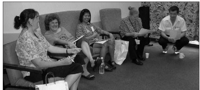
Members meeting at Katherine Hospital