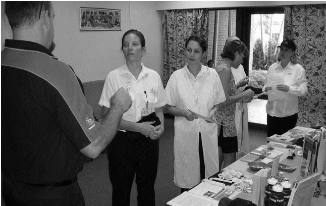
Katherine Hospital Roadshow